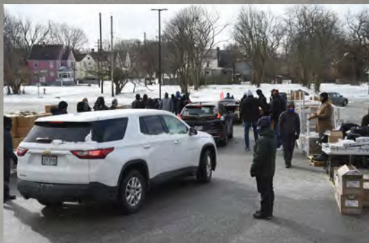
NBA and WNBA Legends man their stations during the Drive-Thru Food Distribution.