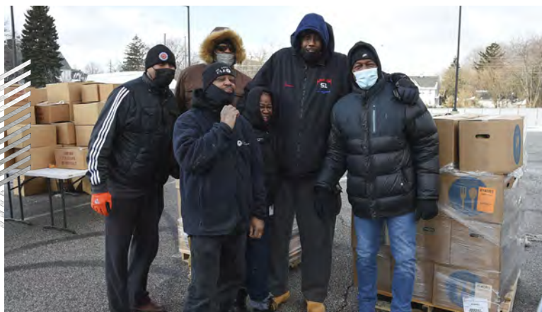
Legends and volunteers waiting for the next car to fill.

"We want to thank all those who are made this event a reality for our neighbors in need."