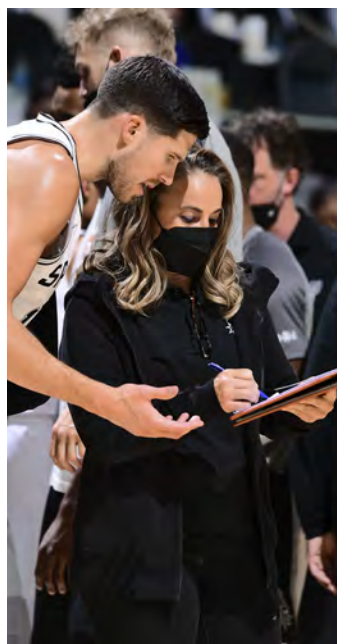
Left: Becky Hammon #25 of the San Antonio Silver Stars drives against Sheri Sam #55 of the Detroit Shock in Game Two of the WNBA Finals on October 3, 2008 at AT&T Center in San Antonio, Texas. Right: Doug McDermott #17 and assistant coach Becky Hammon of the San Antonio Spurs discuss during the game against the Toronto Raptors on March 9, 2022 at the AT&T Center in San Antonio, TX.

for the Eastern Illinois women's basketball team, an athletic director for a high school and even some time with the PGA of Northern California. She also regularly wrote on basketball to flex her analytical muscles the entire time.