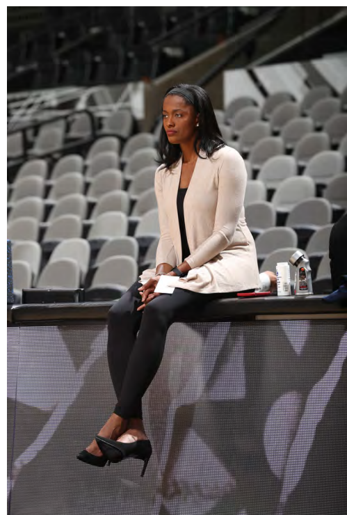
Swin Cash, Vice President of Player Operations for the New Orleans Pelicans, looks on before a pre-season game against the San Antonio Spurs on October 13, 2019 at the AT&T Center in San Antonio, TX.

That certainly describes the way Kristi Toliver entered the NBA coaching space. The Washington Wizards hired her as an assistant coach during her tenure playing for the Washington Mystics. However,