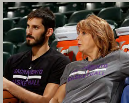
Assistant coach Nancy Lieberman of the Sacramento Kings talks with Omri Casspi #18 of the Sacramento Kings before the game against the Indiana Pacers on December 23, 2015 at Bankers Life Fieldhouse .