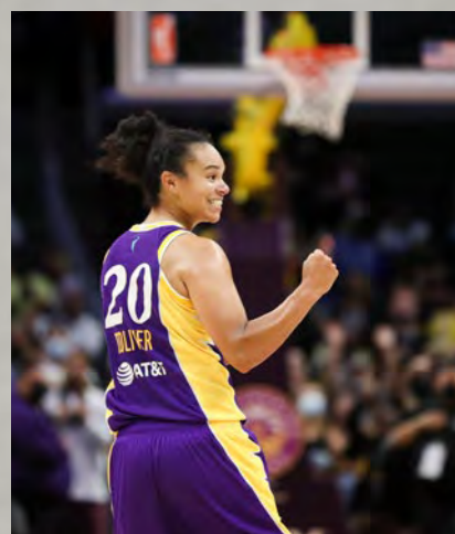
Kristi Toliver #20 of the Los Angeles Sparks reacts to a game-winning shot by Nneka Ogwumike #30 in the second half against the Atlanta Dream at Staples Center on August 19, 2021 in Los Angeles, CA .