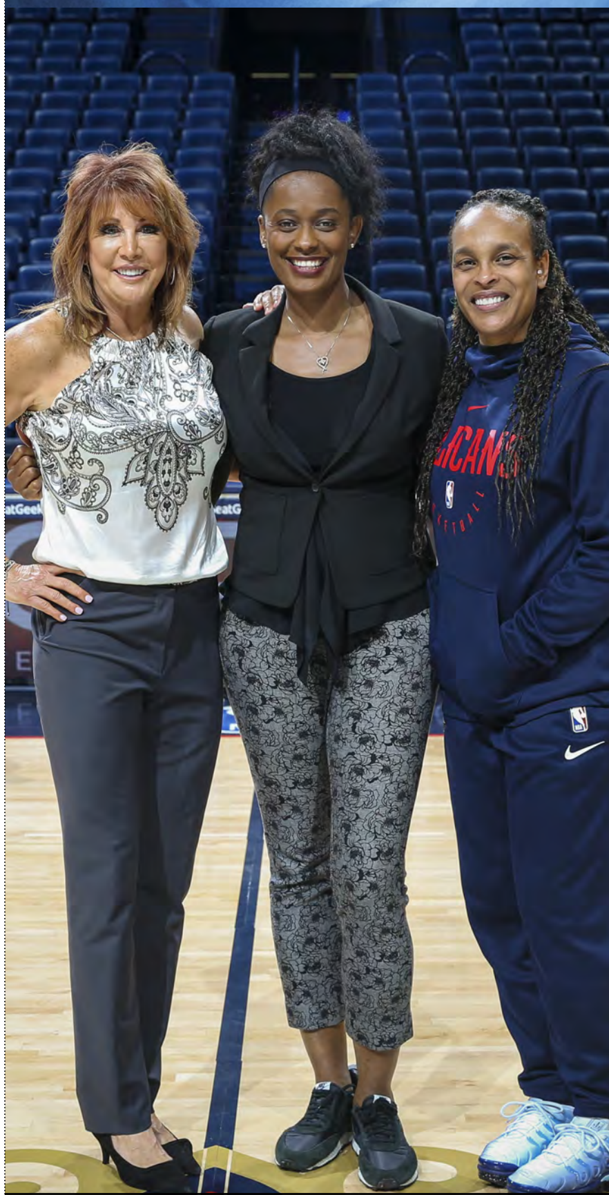
Pelicans broadcaster Nancy Lieberman and assistant coach Teresa Weatherspoon pose for a photo with WNBA legend Swin Cash before the game on February 11, 2020 at the Smoothie King Center in New Orleans, LA.

of Franchise Development with the Liberty while continuing her television career.